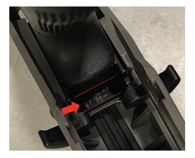
Figure 2B: Improper Fit (too much space)