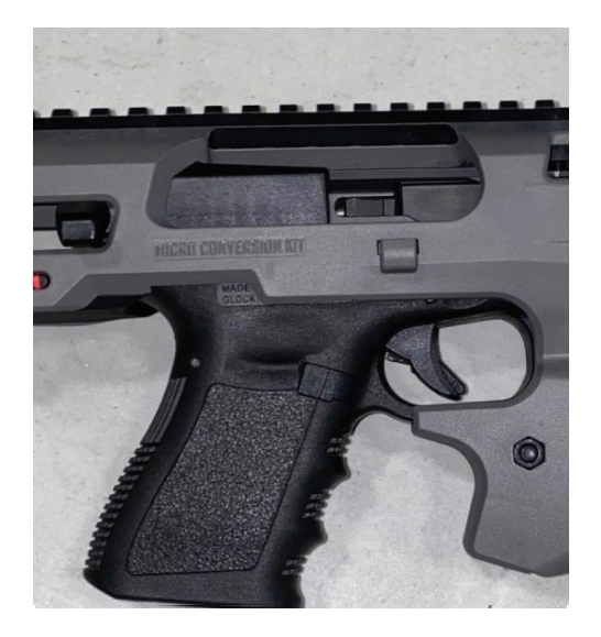
Figure 3A: Rear Sight Properly installed.

If the rear sight is properly inserted into the charging handle sight pocket, the charging handle will sit flush on the top of the handgun slide ( See Figure 3A ). If the rear sight is <u>not</u> properly in the charging handle sight pocket, the charging handle will sit too high and/or be offset in the MCK and the cycle of the handgun will be disrupted by the lack of clearance inside the conversion kit. Also, the gun door will not close properly. (See Figure 3B ). Use this tip as a visual check point to make certain the rear sight has fit into the charging handle sight pocket.